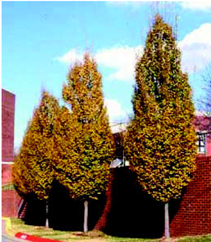
Mature narrow-crowned Hornbeam ( Carpinus betulinus 'fastigiata')

Group A – 7x Hornbeam fronting Golden Cross Hotel from Worcester Street to New Road –